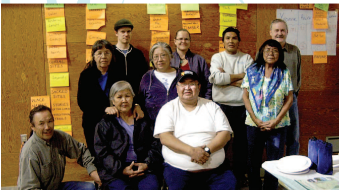
The Łue Túé Sųláı Working Group April 2011 (M Ehrlich)