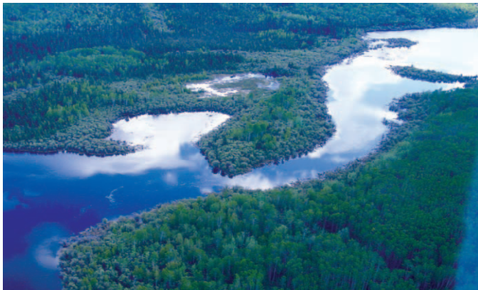
Dédéłıı Dehaa between McGill & Deep Lake

A Jean Marie River Community Initiative Sponsored by the Department of Industry, Tourism and Investment (ITI) Under the Territorial Parks Act